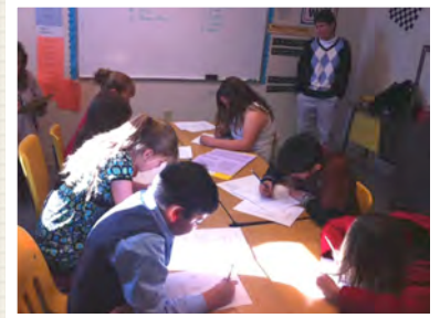
SUNDAY MORNING PRE-TEEN