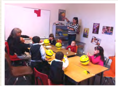
SUNDAY MORNING ELEMENTARY