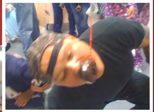
Donut Race Game