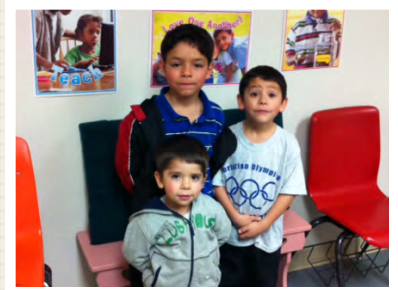
WEDNESDAY NIGHT ELEMENTARY