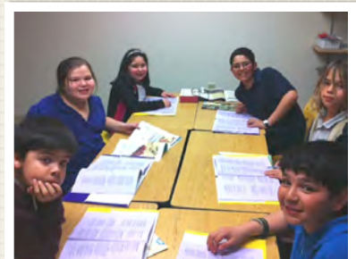
WEDNESDAY NIGHT PRE-TEEN