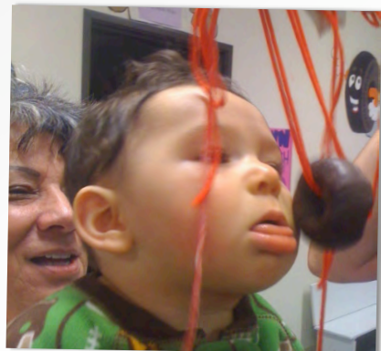
BABY BOBBY LIKES FRIDAY NIGHT DEVOS TOO!